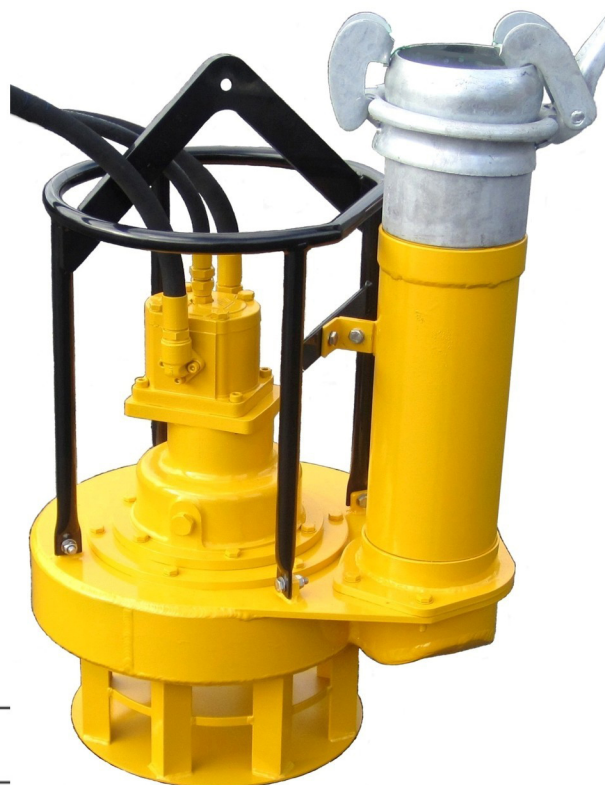
6 INCH SUBMERSIBLE